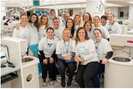
HVCC Dental Hygiene faculty volunteers.

On Saturday October 21st, 2023 a dental community outreach program was held with the coordination of NYSDA, NYS Dental Foundation, Hudson Valley Community College and Kare Mobile. The event took place at the HVCC Dental Hygiene School in Troy, which could easily accommodate the 108 patients seen that day. Over 60 dental hygiene students, along with their attending hygienists and dentists, screened patients and provided dental education. The students gained valuable experience seeing patients with more emergent needs than they ordinarily are exposed to in the hygiene clinic. Volunteer dentists made use of Kare Dental vans to provide 84 extractions, free of charge to patients who needed immediate care. The event was designed to help relieve pressure on Whitney Young and Hometown Health following the recent closure of area dental clinics. A coordinator was available to connect community members with a new dental home.