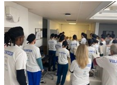
Dental hygiene student volunteers at morning huddle.